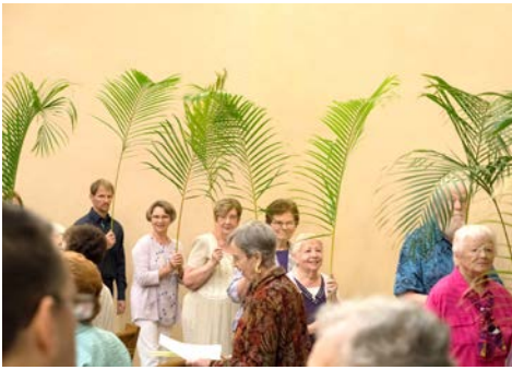
Worship with us during this season!